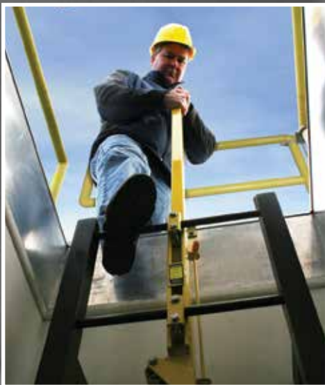
LadderUP® Safety Posts