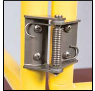
Stainless steel spring hinges and self-closing gate