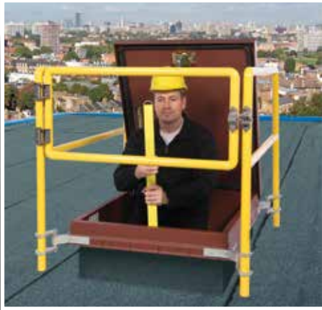
NEW! Bil-Guard® 2.0 Hatch Safety Railing System