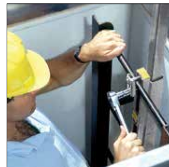
Installs easily on any fixed ladder