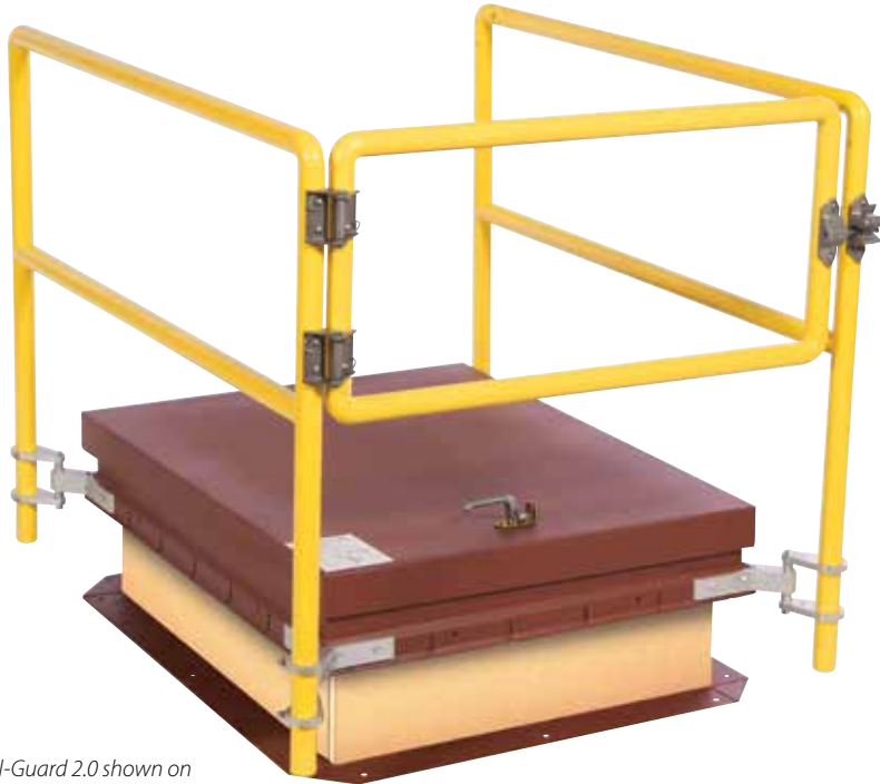
Bil-Guard 2.0 shown on Type S-20 3'0" x 2'6" roof hatch Patented and patent pending