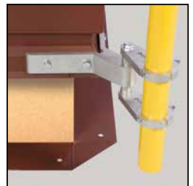
Pivoting post mounting brackets