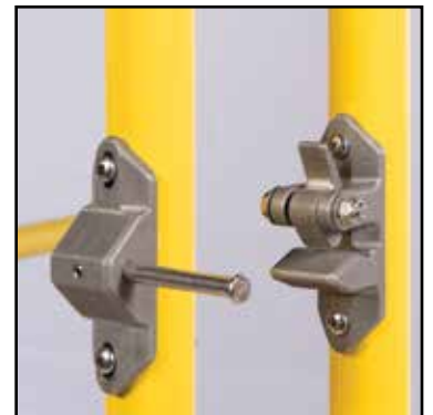
Automatic gate latch with interior and exterior release patent pending